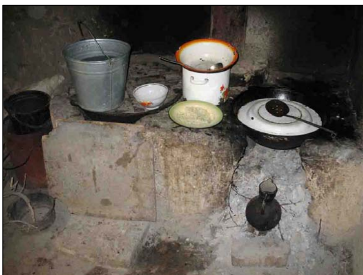
The traditional wood fired stoves are unsuitable for comparative testing

Chopping the vegetables small in the traditional cooking pot would have tenderized them earlier, but the traditional dish included the meat. The long cooking process also guaranteed adequately the stewing of the meat. Besides, if one is traditionally used to big chunks of meat and vegetables, you would not appreciate mini cubes in the soup.