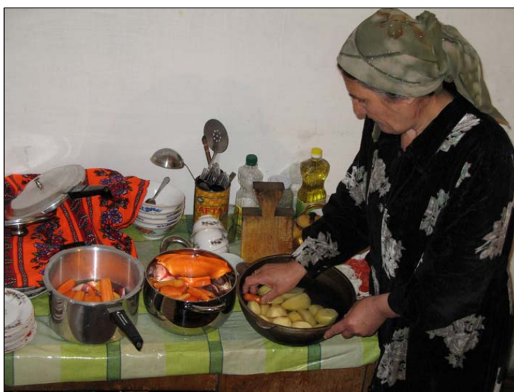
The cook prepares equal portions of the ingredients in the two pots.

As a component of the renewable energy training for Welthungerhilfe staff, I held a short training session on the pressure cooker in Ayni village located at 1500m above sea level. The purpose of the training session was to demonstrate the energy saving aspect of the pressure cooker by comparing the same dish (soup) cooked according to the traditional method and using the pressure cooker and a hay box (heat-retention box).